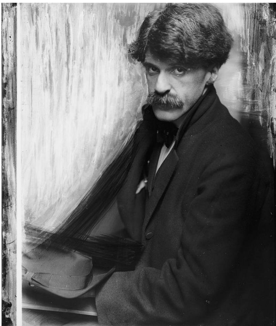
Portrait of Alfred Stieglitz - Gertrude Kasebier, 1902

Website: www.VillicanaDAnnibale.com Email: danielle@villicanadannibale.com Cell: (+39) 338 600 5593